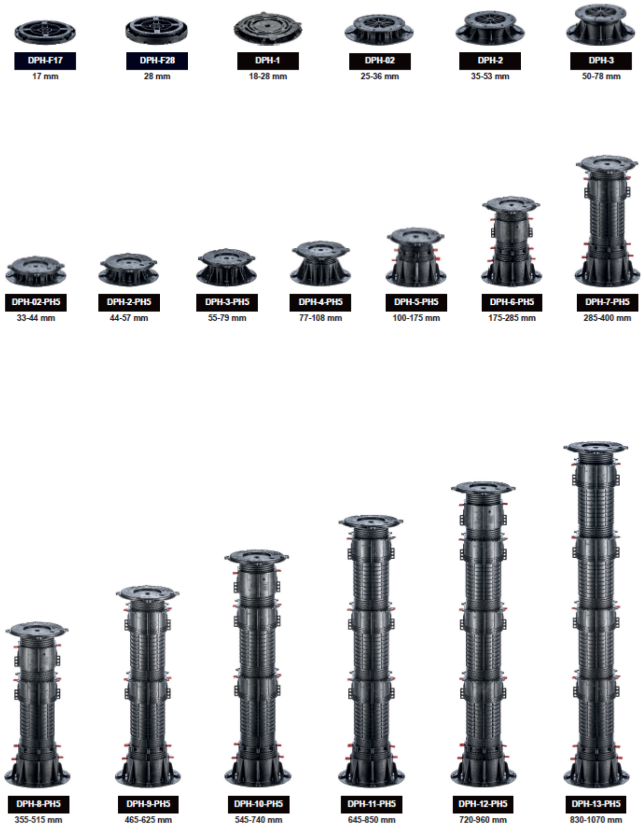
FIGURE 1 – BUZON PEDESTALS – DPH SERIES