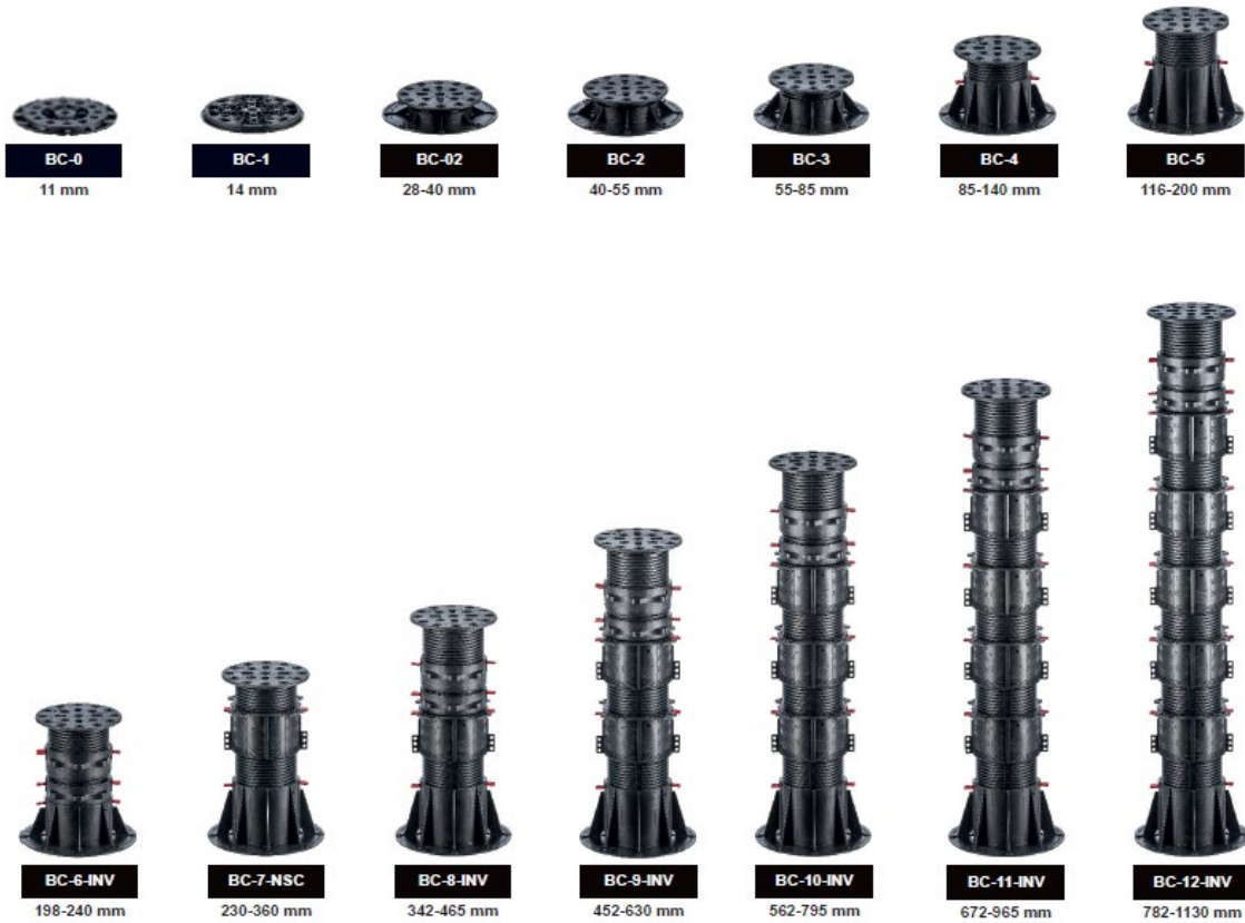
FIGURE 2 – BUZON PEDESTALS – BC SERIES