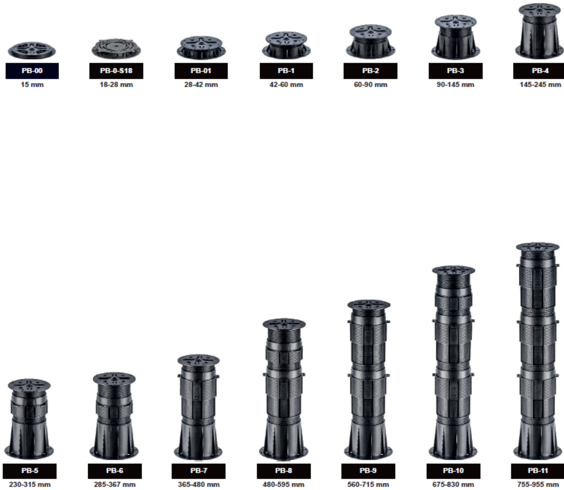
FIGURE 3 – BUZON PEDESTALS – PB SERIES